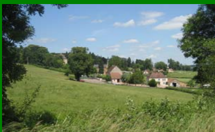
The Domain « Le Pré de la Serve » embedded in its green frame in the hamlet « le Bourg » in the village of Lugny-les-Charolles below the Castle and the church build in yellow stones from the neighbouring hamlet of « Orcilly »

For you local needs for additional housing capacity when organizing family gathering or professional seminars in the area.